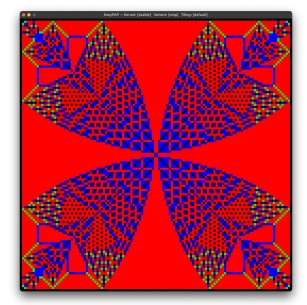
(a) Starting with 25.000 grains in a center cell.