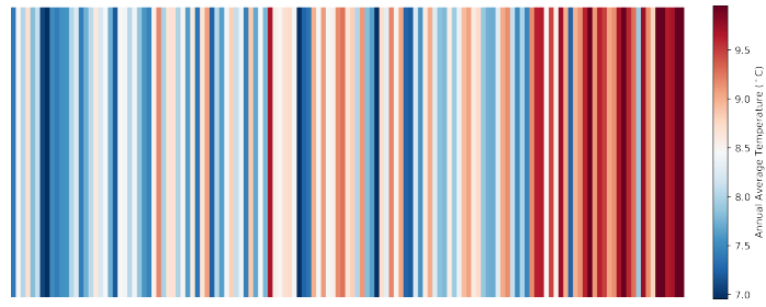
Figure 6: Annual average temperature rise for Germany ranging from 1881 (left) to 2019 (right); inspired by https://showyourstripes.info.

The task of the programming assignment is to rebuild the warming stripes, made popular by British climatologist Ed Hawkins. The original warming stripes show clearly and vividly the trend in global average temperatures over the past decades. In the programming assignment, we calculate the annual average temperatures for a time span in a specific geographical region and yields the single, stunning image given in Fig. 6. This image visualizes the long-term trend in annual average temperature rise for Germany in the period from 1881 to 2019. The annual temperature ranges from a low around 7 °C to a high around 10 °C. The range of temperature values used in the colorbar are manually specified by first computing the average temperature of the whole time span and then adding and subtracting 1.5 °C to set the maximum and minimum temperature values, respectively.