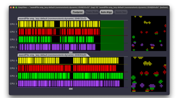
Figure 3: Comparison of two execution traces of the asandPile kernel over a 2048 \times 2048 sparse configuration. The traces display tasks executed during the same 500th iteration performed by a lazy OpenMP variant. The top trace features 32 \times 32 tiles, against 64 \times 64 tiles for the bottom one.

The last assignment is devoted to combining two different programming paradigms to address hybrid or heterogeneous architectures (e.g., MPI + OpenMP, OpenMP + OpenCL). It implements the well-known Ghost Cell Pattern [10]: in every iteration, each pair of neighboring processes exchange a copy of their borders. However, the