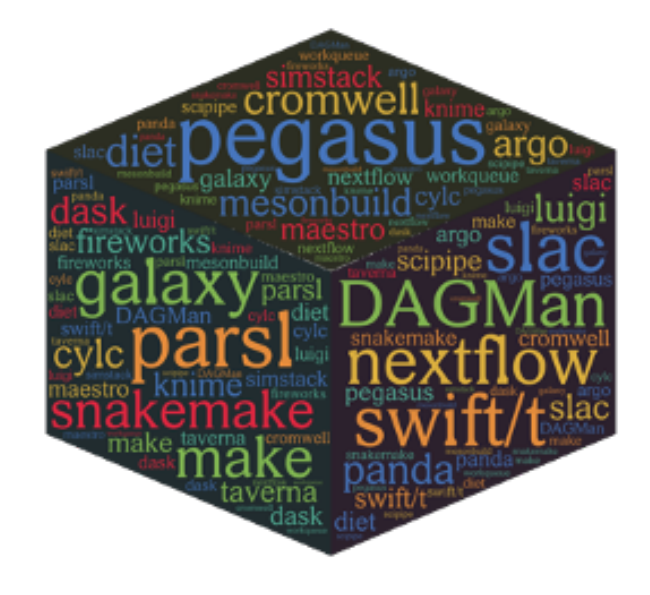
Figure 2: Word box of used WMSs obtained from the Community Research Infrastructure Survey.

For each of the themes shown in Table 2, the lead gave a plenary 5-minute lightning talk, highlighting the theme and its challenges (videos for each presentation can be found at the WorkflowsRI's YouTube channel [7]). Each theme was then discussed in breakout sessions, with the lead coordinating the discussion and a shared document being used to capture notes and for asynchronous discussion. The goal of these sessions was to identify other challenges, if